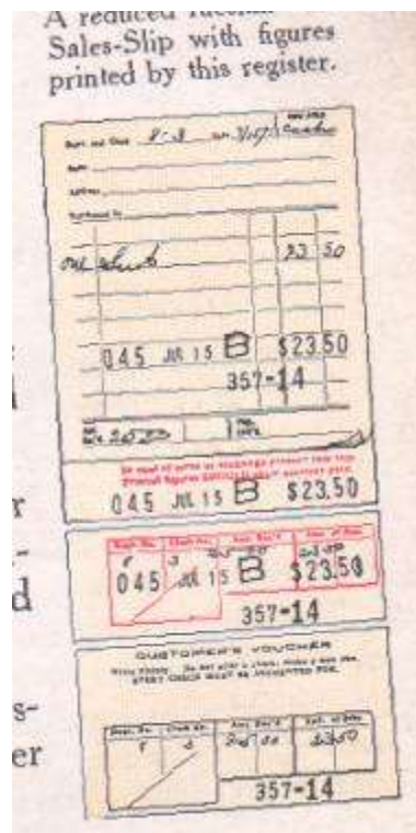
A reduced facsimile of Sales Slip with figures printed by this register.

Register is also used in connection with systems for dining cars, heat, light, and power companies and public-service corporations.