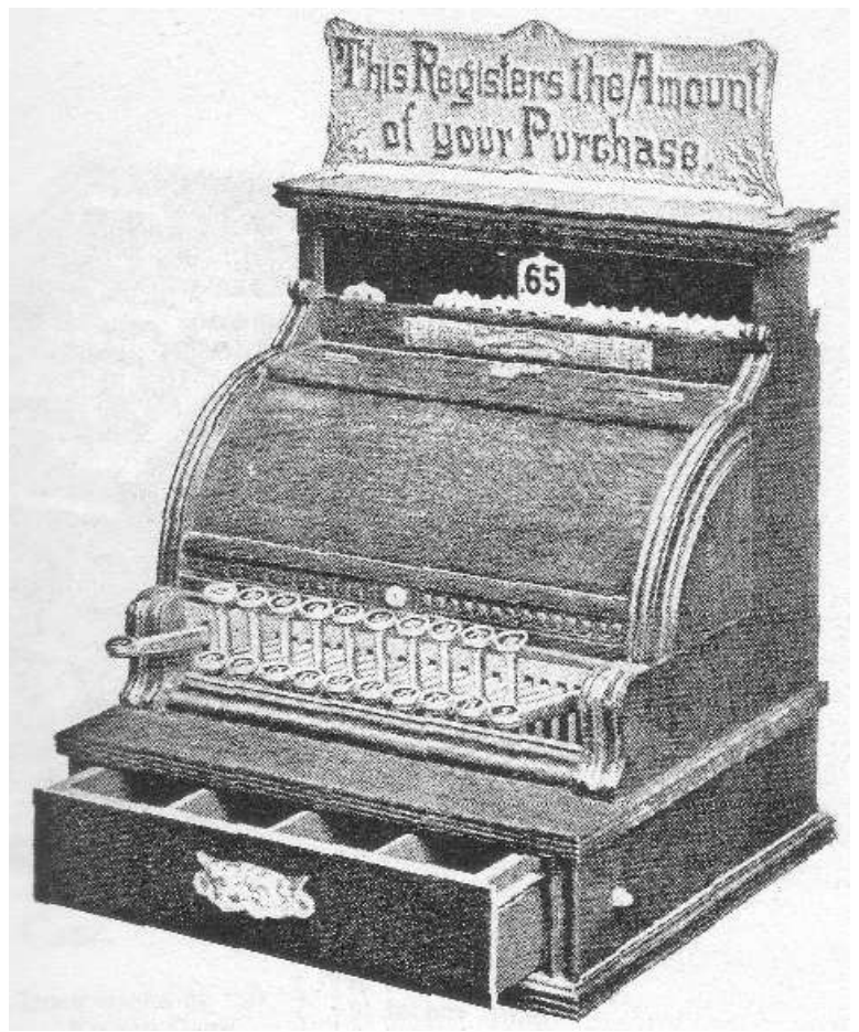
No. 34 Total-Adding Cash Register. Dimensions: 16 1/2 inches wide, 15 inches deep, 24 inches high.