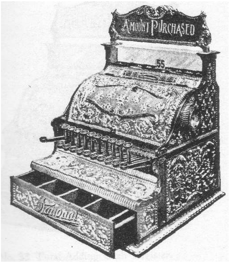
No. 32 Total-Adding Cash Register. Dimensions: 15 3/4 inches wide, 15 1/8 inches deep, 22 1/2 inches high.