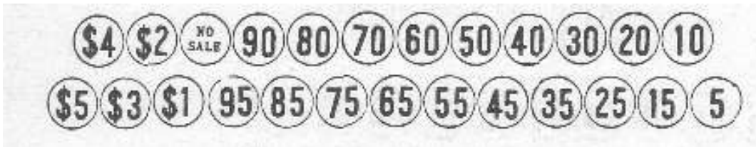
Standard Arrangement of Keys.

Twenty-five registering keys, of any denominations desired.